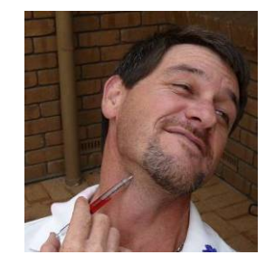
Syringe pen supplied by TMVC

First aid kit has been supplied by Lukas's Tropical Illnesses Doctor.